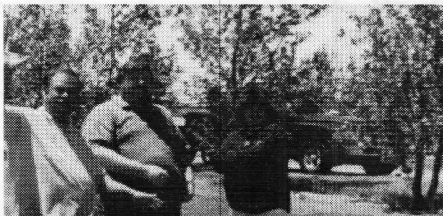
Won't it be great when Chip's trees grow up to give shade and hold up antennas?

P.A.I.N. 146.94 8:00PM SUN *CLOUD CHASERS 145.92 8:00 PM MON * SIDEWINDERS 144.2 USB 8:00 PM MON *A R E S 146.52 8:00 PM THURS *PANHANDLE TRAFFIC AND EMERGENCY NET 3933 KHZ LSB 00:00 UTC DAILY *A M S A T 3840 KHZ 9:00 TUES *S W LYNX NET 147.56 6:00 PM THURS