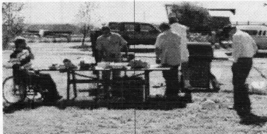
Field Day 1995 at Chips

bring your own shade. But that doesn't stop Panhandle Hams from getting out there and having a real fun field day any more than torrential rains do in florida